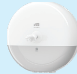
Tork SmartOne 680000 / 680008 BCHS CODE 064360 / 064361

Single sheet dispensing – reduces tissue consumption by up to 40%*