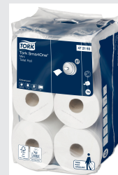
BCHS CODE: 064139

Smaller roll for when space is at a premium