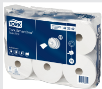
BCHS CODE: 064138

1,150 sheets per roll, perfect for high traffic washrooms