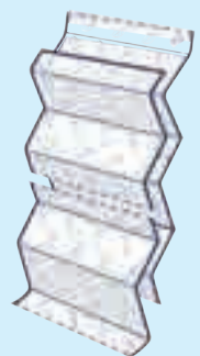
Bundles dispense without interruption one towel at a time