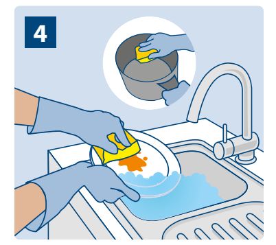
Immerse items for 5 minutes. Agitate with a cloth, brush or scouring pad as required.