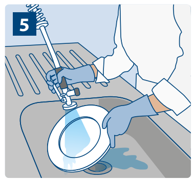
Rinse thoroughly with clean water.