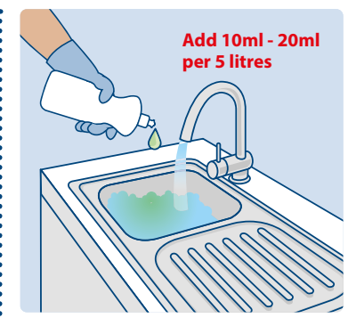
Bottle: Fill sink with hot water and add 10ml - 20ml per 5 litres of hot water depending on soiling level.