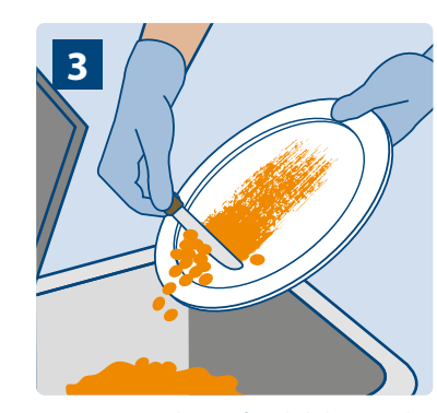
Remove any loose food debris and soiling before being washed.