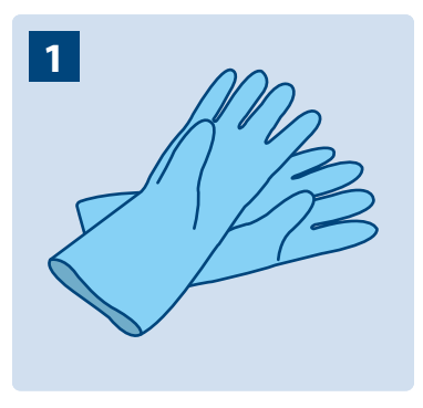
Use appropriate PPE as indicated in the safety data sheet.

Refer to the Safety Data Sheet (SDS) for detailed information and immediate first aid measures including medical emergency helpline number.