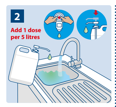
Dispenser: Fill sink with hot water and add 1 dose per 5 litres of water.