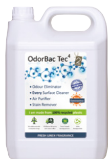
100% recycled plastic container enters the loop

Simple and easy way to stop plastic waste packaging