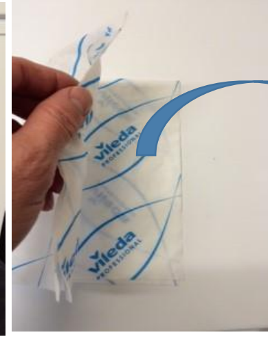
After wiping first surface, turn over cloth, repeat so all 8 sides are used