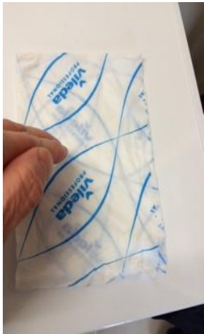
5 take cloth keeping it folded