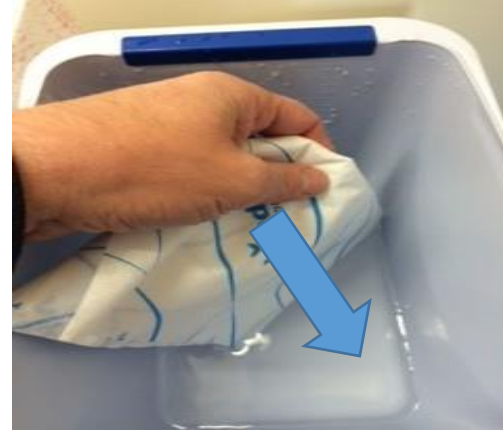
Remove cloth from water