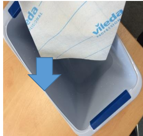
Place cloths into bucket of solution or dip single cloth in solution