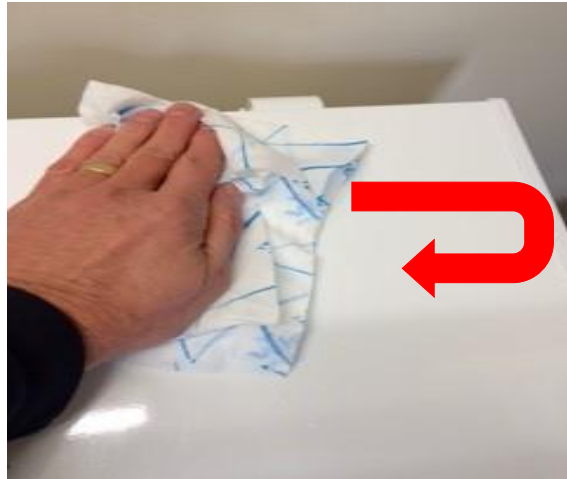
Wipe using over lapping method