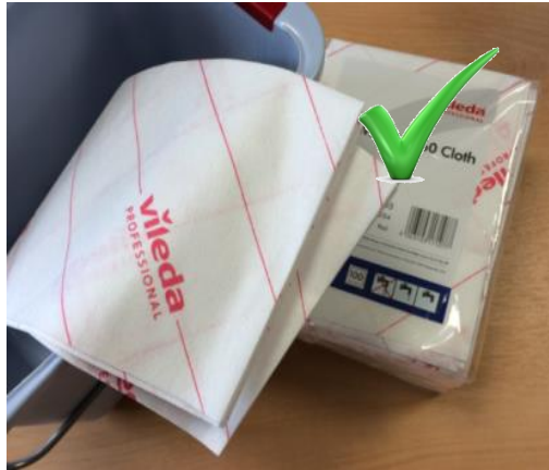
Select the correct colour coded cloth for your cleaning task