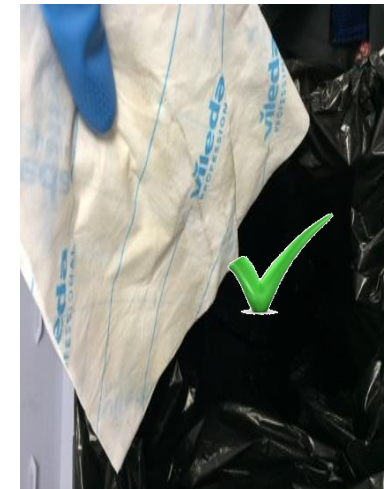
Cloth then goes to waste